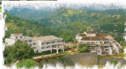
Institute of Fundamental Studies