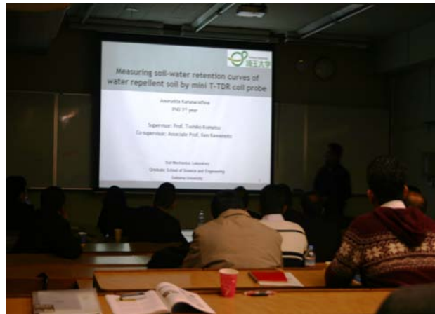
Presentation by Sri Lankan Graduate Student of Saitama University