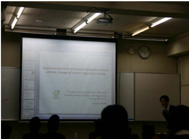
Presentation by Japanese Graduate Student of Saitama University