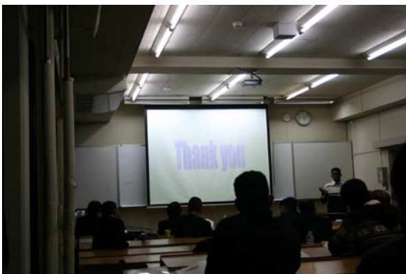
Presentation by Research Assistant of Institute of Fundamental Studies