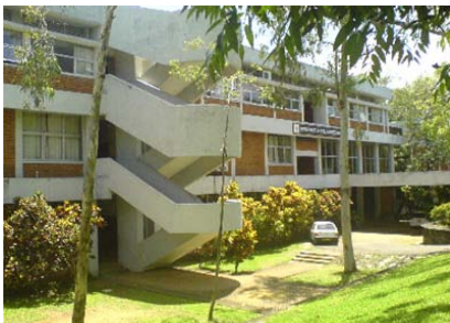
University of Moratuwa