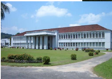
University of Peradeniya